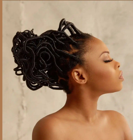
Thread/ Irun Kiko